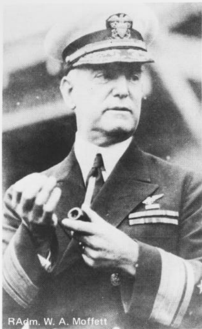
RAdm. W. A. Moffett

clearly demonstrates this point." For example, the development of the torpedo had meant, Moffett wrote, that "the whole structure of the fleet had to be changed in order to cope with the possibilities of the new weapon." Submarines were built to use torpedoes. Then navies built destroyers to defend against submarine attacks and to fire torpedoes at capital ships. To counter the threat of torpedo attack from destroyers, the naval powers had built fast cruisers. In addition they changed battleship design by adding an armor belt along the waterline of the battleship to reduce the effectiveness of the torpedo. At the same time that these changes had taken place in ship design, navies "entirely revised" fleet tactics to cope with the threat of possible torpedo attacks. "Today," Adm. Moffett pointed out, "we are in the midst of a similar evolution. The airplane has affected fleet tactics to an even greater degree than the torpedo . . ." Although Moffett did not elaborate on what he saw as the changes which the airplane had wrought in fleet tactics, the experiments with the fast carrier task force in the interwar period were certainly an example of one such change. The admiral's analogy between the changes in ship design and fleet tactics, brought about by the