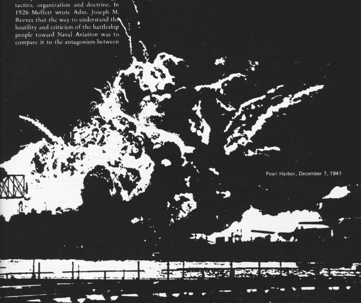
Pearl Harbor, December 7, 1941

Moffett not only understood why Naval Aviation had an uphill struggle for acceptance within the fleet; he also saw the impact that aviation would eventually have on the Navy. In a memorandum drafted for the Secretary of the Navy in 1931, Moffett explained that "The basis of power in a fleet is balance. As evolution in naval architecture occurs, the structure of the fleet must be changed in order to maintain this balance under the new conditions. The history of our Navy